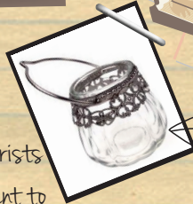
Victorian tea light holder with lovely silver decoration

1. Line the tea-light holder with the lace and, having roughly cut it to shape, press in the florists foam (the firmer fit the better so you might want to wrap the lace round the foam and push them in together)